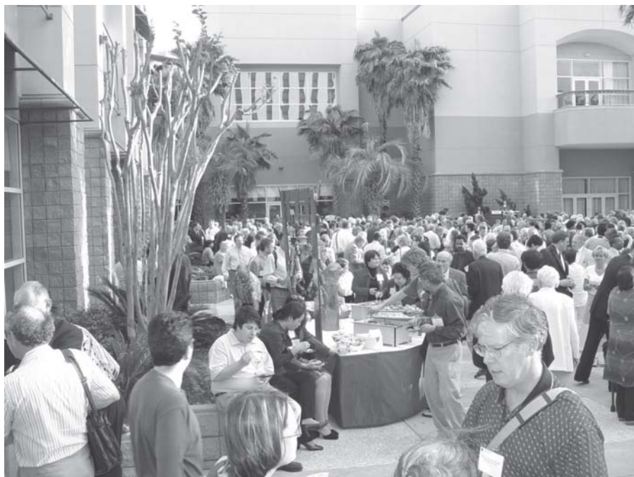
Members had several chances to discuss meeting topics and socialize.

dates for 2003 president-elect. The name of the Cellulose, Paper and Textile Division (CELL) was changed to the Cellulose and Renewable Materials Division (CELL).