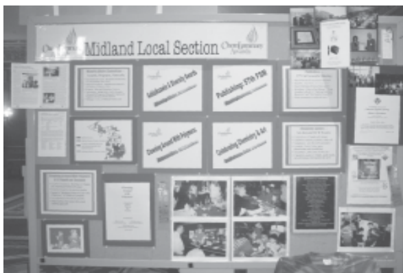
The poster for the Midland Section always attracts attention. Section members can be proud of what the poster represents.

by a show of hands. An appeal for a paper ballot re-vote was disallowed. A petition for consideration on funding for divisions and local sections also received much discussion in caucus, council, and the hallways, with a promise that more thought will go into the final petition before the New Orleans, Spring Meeting.