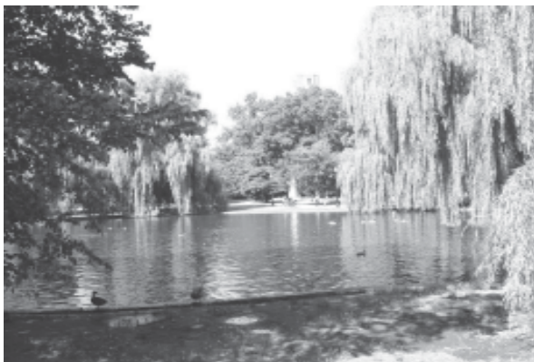
A view of the Boston Public Gardens.

“To commemorate the discovery that the inhaling of ether causes insensibility to pain. First proved to the world at the Massachusetts General Hospital in Boston. October A.D. MDCCCXLVI.”