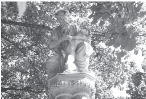
The inventor of ether? Will we ever know?

One of the suggested assignments given to me, at the Section Board meeting was to take a picture of the statue of the inventor of ether. The statue supposedly stood in the beautiful Boston Public Gardens. As I sat on the bus on the way to the Public Gardens, I began to contemplate an article about ether. Memories of a Modern Physics class surfaced when I remembered that scientists once believed that all waves needed a medium to propagate. A sound