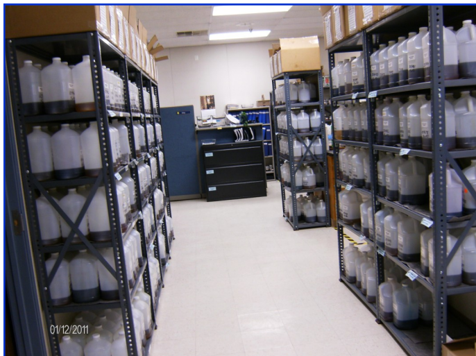
Oil samples ready for testing.

As a consequence of such ongoing opportunities and challenges in the associated industries, Savant and Tannas have developed and provided several key engine oil bench tests. These are now required by industry specifications. For a small enterprise, Savant