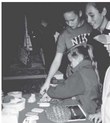
The Dow Corning moldmaking exhibit was a big hit with Sci-Fest attendees.

Advertising included 8000 4.25-inch x 5.5-inch handbills that were distributed by individual ACS/MMTG members on Halloween. An additional 2000 8.5-inch x 11-inch flyers were produced. Both the handbills and the flyers were distributed to many science teachers in Auburn, Bay City, Freeland, Midland, Mt. Pleasant, and Saginaw by having different people send the fliers to science teachers through their children.