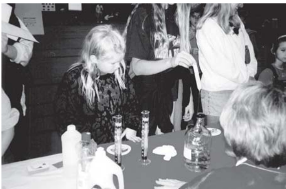
At the ACS/MMTG Colors of Chemistry display, visitors work with density columns and PVA "slime."

New attractions this year included Delta College Astronomy Club, Delta College CAD/CAM, Delta College Graphic Arts, Delta College Art Department, Dow Corning moldmaking, Dow Corning molecular modeling, and traditional film photography.