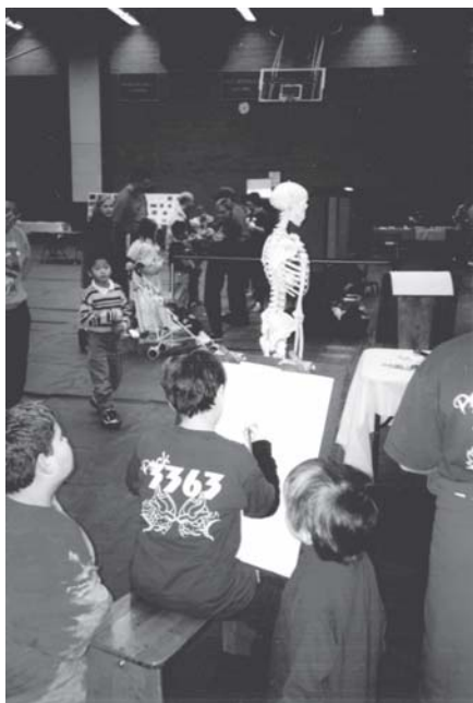
Students create artwork using a “bony friend” as a model. No problem with the model moving at the wrong time!