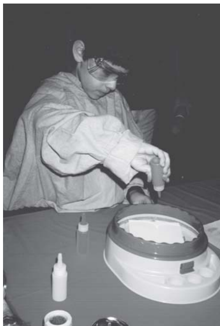
This budding scientist is intent on his “spin art” experiment at the National Chemistry Week display.

Midland, and Saginaw. A 4-minute video segment regarding the event was aired on CNN Headline Hometown News in Bay City, Midland, and Saginaw. Notices regarding Sci-Fest were sent to the Bay City Times , Midland Daily News , Mt. Pleasant Sun , and Saginaw News for public service announcements. Unfortunately none of the papers ran one for us this year. A volunteer thank-you letter was published in the Bay City Times and the Midland Daily News .