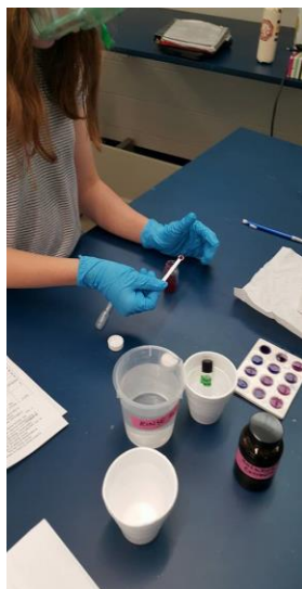
Equilibrium labs at Midland High School

Mid-Michigan Technicians Group hosted a 4-day summer camp at Delta College (see the July issue of The Midland Chemist for details). We held a "Firework'd Up!" science cafe at MCFTA June 15, and did hands-on sessions for the Society of Women Engineers on two Saturdays in June ("Si-ence"--all about silicon-containing materials). At River Days, another "Bubble-ology" set of experiments included bubbles made with three different gases, and investigation of foam peanut properties (Styrofoam vs. degradable cornstarch).