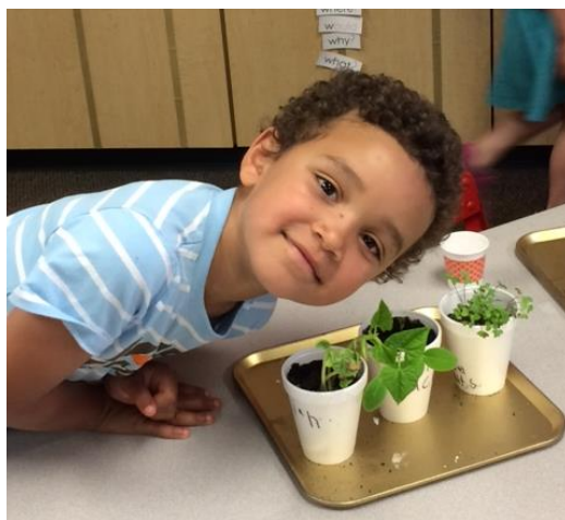
one of the "Kinder-gardeners"

In late April we did our first "Super Science Saturday" for grades 5-8 at St. Brigid's with two 2-hour hands-on sessions ("Sci-Flight" and the Science of Frisbees, along with "Carbon Dioxide is CO 2 L!"), including our first "lock box" puzzle activity. The school year ended with hands-on Equilibrium labs conducted at Midland High School in late May, and a "Kinder-GARDENING" project with St. Brigid. This involved donation of seeds and soil, and a presentation on how plants grow, followed by pick-up of the resulting seedlings for transfer to the ACS garden. Also in May, we led hands-on activities at the Blessed Sacrament STEM Day (density, and "Bubble-ology"), and for Discovery Day at Nouvel in Saginaw we did "Up in the Air with CO 2 " and "Electrons on the Move" (about electrolysis). On May 4th, Chef Aaron Gaertner presented "Bacon and Eggs: Not Just for Breakfast" (a food science cafe) at Midland Center for the Arts.